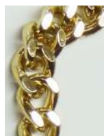
Removal of polishing pastes