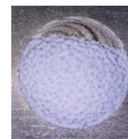
After 10 minutes with Pulse