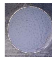
After 10 minutes with Sweep

The adjustable Pulse function increases the ultrasonic peak power. The ultrasonic impacts infiltrate the soiling which then flakes off. Ideal ly for hard, encrusted dirt such as plaster and polishing pastes. In addition, the cleaning effect is up to 20 % faster visible.