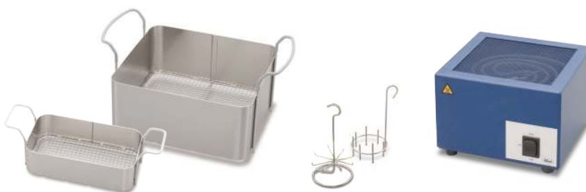
Cleaning baskets in different dimensions and with different mesh sizes: 7x1mm, 9x1mm or 16x1.2mm, ring holder, clamping devices for watch straps, hot air dryer, etc.

Thus Elmasonic EASY ultrasonic units can be used to clean jewellery and watch parts, laboratory instruments, to pre-clean dental or medical instruments pre-clean medical instruments or for industrial parts cleaning.