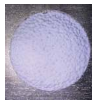
After 5 minutes with Pulse

The adjustable Pulse function increases the ultrasonic peak power. The ultrasonic impacts infiltrate the soiling which then flakes off. Ideal ly for hard, encrusted dirt such as plaster and polishing pastes. In addition, the cleaning effect is up to 20 % faster visible.