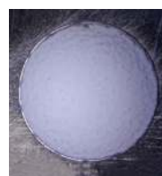
After 5 minutes with Sweep

The permanently integrated Sweep function ensures an even sound field distribution and therefore an even removal of soiling. Ideal for fats, oils and pigments, as these are rapidly dissolved in the cleaning solution.