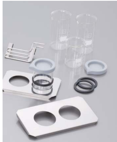
Cooling coils, glass beakers, covers with holes to insert glass beakers, etc.