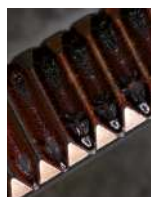
Removal of blood