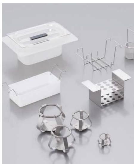
Hostalen- and acid resistant plastic tubs, test tub or tool holders, clamps and immersion baskets