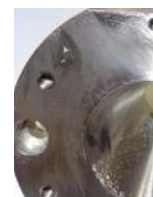
Removal of grease and silicone