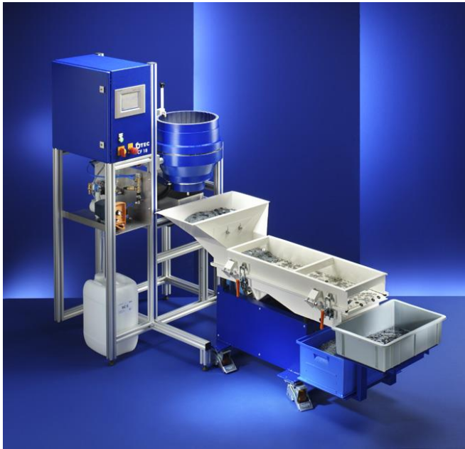
Fig. 1: CF 18 machine with Unisepa

Process description (see fig. 1 - CF 18 machine):