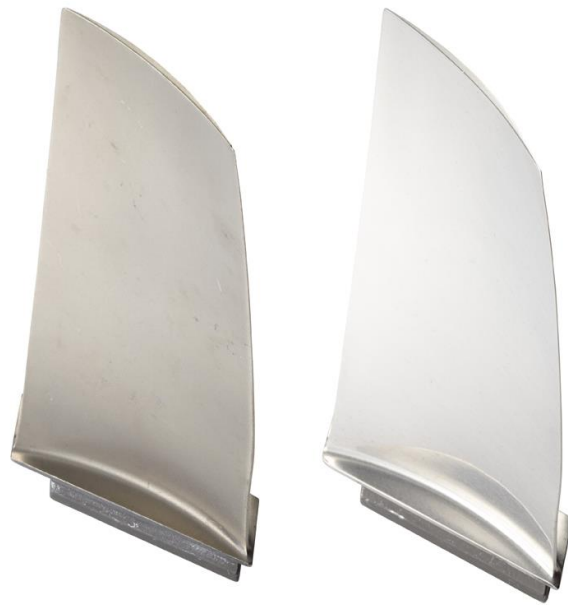
A turbine blade pre- and post-processing

One of the most crucial components of a working engine system is its engine blades, such as turbine or compressor blades. A turbofan engine, for example, has many parts: at the front, the fan draws in the air and directs it into the compressor, which is composed of several blades arranged in a row and decreasing in size towards the end of a narrowing tube. Using a rotational movement, the suction air is compressed to up to a thirtieth of its volume, which in turns compresses and heats the gas. The air is then fed into the combustion chamber where it is mixed with injected kerosene and burned. The resulting energy propels the high-pressure turbine where the turbine blades driving the compressor are installed. The downstream low-pressure turbine is also set in motion using this energy. The low-pressure turbine consists of longer turbine blades and is directly connected to the fan. The turbine ensures that the fan rotates. The fan not only sucks the air into the interior, but past the compressor and the turbine. The cold air, which is fed past the interior, generates the greatest propulsive force. The process inside the engine merely ensures that the engine remains running. So the exhaust gas flow produces 20% of the propulsion and the fan, 80%. Both the turbines and compressor blades are subject to high temperatures and pressures. Manufacturers have therefore implemented strict regulations for the production and processing methods used.