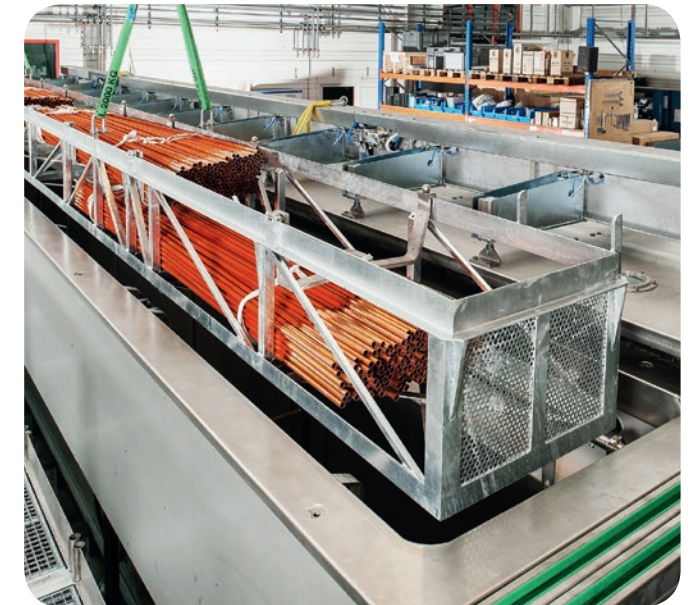
Cleaning of elongated copper tubes

The development and construction of special plants has always been our great passion. From the cleaning of tubes or agitators to optical components, everything is possible. We are always looking forward to new challenges.