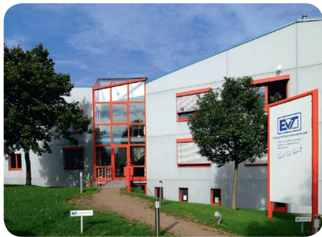
Our company headquarters in Sternenfels

The guiding principle “Made to measure and need” is taken literally by us, because detailed consultation and the design of a new plant tailored to the customer’s needs are largely responsible for the long-term satisfaction of our customers. With our experience of more than 28 years in the field of industrial parts cleaning, we will be happy to advise you on the implementation of your cleaning requirements.