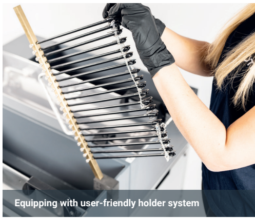
Equipping with user-friendly holder system