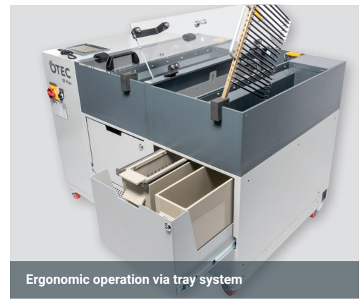
Ergonomic operation via tray system

Processing of delicate and intricate jewellery with complex geometries requires particularly gentle smoothing and polishing. The EF-Flex reaches a new dimension of sparkling brilliance even on pieces of jewellery set with stones. Manual work is minimised. Perfect process reliability, processing even in the smallest of corners, and extremely short process times ensure cost-effectiveness and high-volume processing.