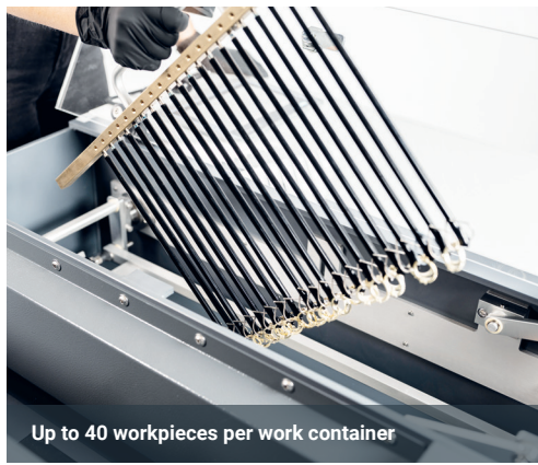
Up to 40 workpieces per work container